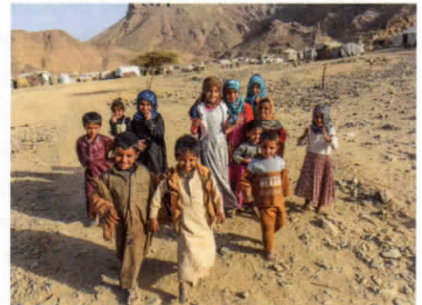
Yemeni children in refugee camp in Yemen

When next you see a news item about refugees, say to yourself, "Jesus, Mary and Joseph have been through that sort of experience."