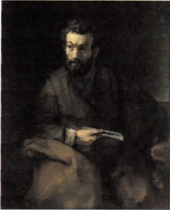
"Saint Bartholomew" by Rembrandt (1606-1669).

He was born at Cana and brought by the Apostle Philip to meet Jesus. Nothing further is known for certain.