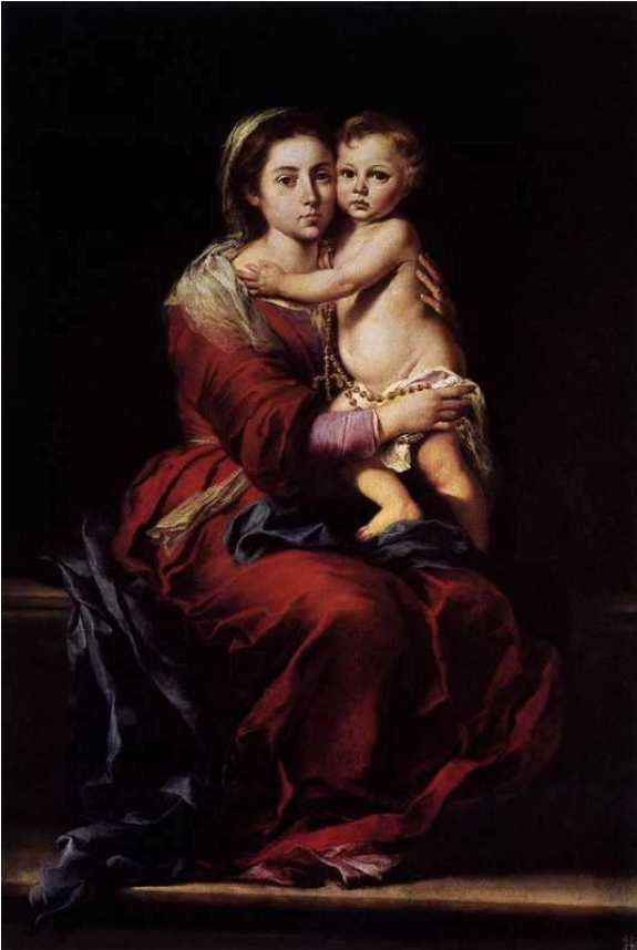
— Virgin and Child with a Rosary (c.1650) by Bartolomé Esteban Murillo (1617-1682), Museo del Prado, Madrid.

The feast of the Holy Rosary was instituted by Pope Pius V to celebrate the anniversary of the defeat of the Turkish fleet at the battle of Lepanto on the first Sunday in October 1571, which ended the threat of Muslim domination of the Mediterranean and was ascribed in part to the prayers and processions of the Rosary confraternity in Rome. Later the feast was moved to the fixed date of 7 October.